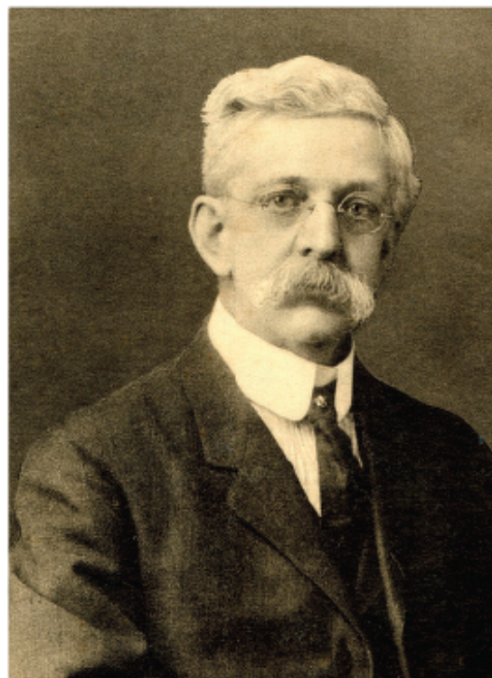
Fig. 1. Frank S. Collins (from Setchell, 1925)

Setchell (1933) described Collins (Fig. 1) as being “a slender man, of medium height, early gray, but with youthful appearance, roundish face, with broad mustache”, with somewhat a