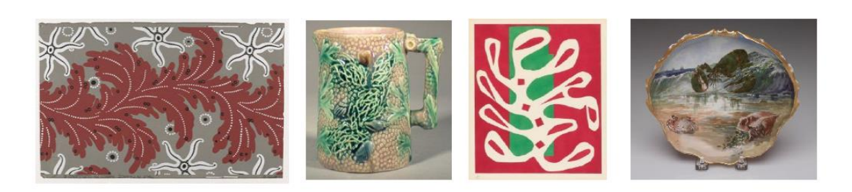
* Discounted admission for PSA 2023 meeting attendees at the New Bedford Whaling Museum *